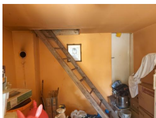
Village Info Zajk