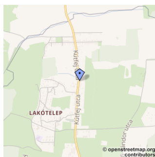
Village Info Kútfej