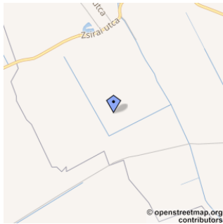
Village Info Und